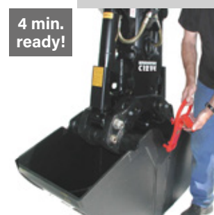
4 min. ready!

Remove the exchange support. Ready for use!