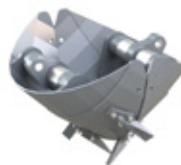
Well shaft shells