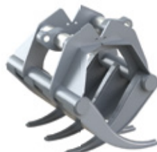
Hay and forestry tines