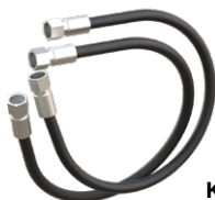
KM 203 01