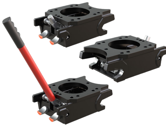
KM 507 01 HD