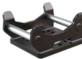
KM 507 02 HD