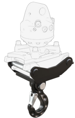
KM 507 03 HD